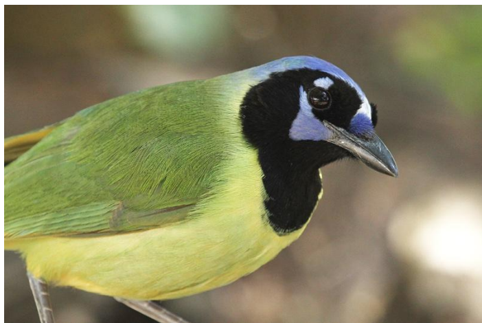
Green Jay

Geographically, the Lower Rio Grande Valley extends from Falcon Dam in the north and west to the mouth of the Rio Grande and the Gulf of Mexico to the south and east. Within this broad area, the Valley can be further divided into the "Lower," "Middle," and "Upper" Valleys. We will have four full days to explore the parks and preserves that dot the Middle Valley. All locations offer superb birding in terms of diversity, but of equal importance is the opportunity to observe birds at close range.