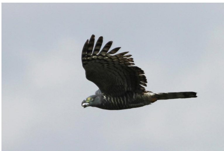
Hook-billed Kite

January 24, Day 2: Morning Birding at Santa Margarita Bluffs. After an early breakfast we will travel back downriver for a morning at the private and scenic Santa Margarita Ranch. Here, soaring limestone bluffs overlook a long stretch of the Rio Grande, revealing a wilder side of South Texas. Perched atop the bluffs, we will enjoy sweeping views of the river both upstream and down. January is a good time to spot waterfowl flying up and down the river, as well as Ringed and Green kingfishers. Altamira and Audubon's orioles are resident, as are Couch's Kingbird, Great Kiskadee, and Green Jay. This location is also one of the better places to watch for Muscovy Duck, Red-billed Pigeon, and Hook-billed Kite. A morning vigil atop the Santa Margarita bluffs often produces dozens of species of birds.