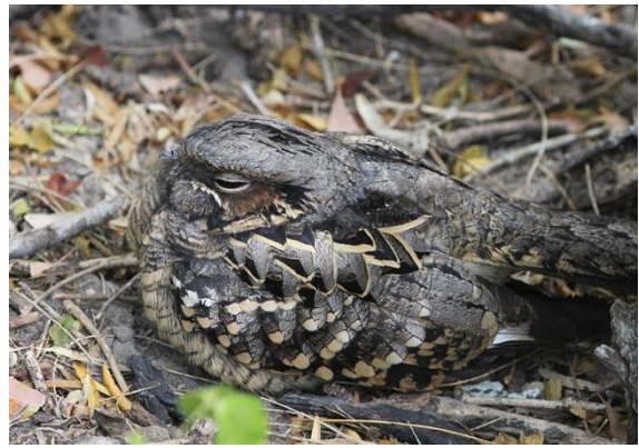
Common Pauraque