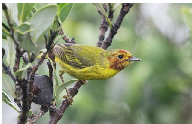
"Mangrove" Yellow Warbler

January 21, Day 9: Morning Birding at Brownsville’s Resaca de la Palma State Park; Sunset Boat