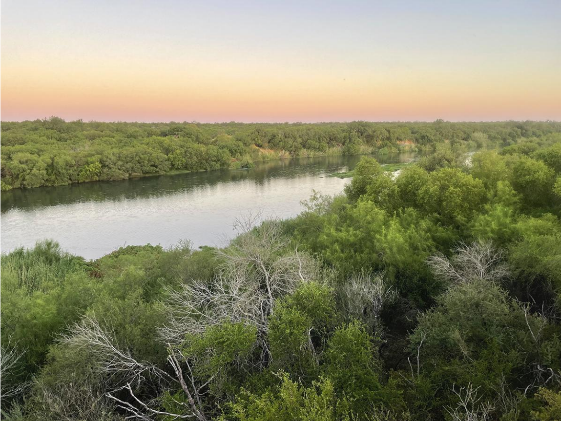
Scenic view of the Rio Grande from the bluffs of Santa Margarita

This extension to VENT’s South Texas in Style tour seeks specialty birds of the desert and riparian habitats of the northern region of the Lower Rio Grande Valley. This area around Falcon Dam is rich in history and retains much of its frontier character, providing a great backdrop to the region’s excellent birding.