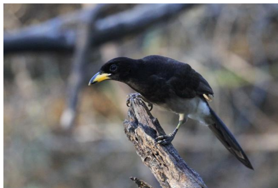
Brown Jay

Recent sightings of Brown Jay at Santa Margarita Ranch may warrant a longer trek from the bluffs to the riparian forests below. It is in this riparian habitat along the river that the jays have been found, sometimes numbering up to seven individuals (as of Jan 2025). We will use the most current information to determine whether or not this two-mile hike with short stretches of rugged yet paved trail is warranted. This habitat is also where we could see Gray Hawk, Red-billed Pigeon (rare), and Audubon's Oriole. With recent sightings of Rose-throated Becard, it feels as though almost anything is possible along this wild stretch of river. After lunch in Zapata, we will have a little down time before afternoon birding options at Falcon County Park, FM-2098 ponds (near Falcon Heights), and Zapata City Park (library).