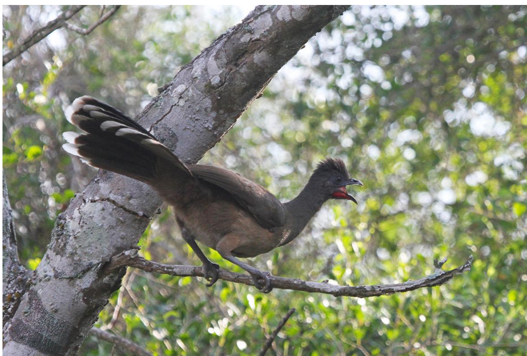
Plain Chachalaca

January 16, Day 4: Morning Birding Santa Ana National Wildlife Refuge; Afternoon at Edinburg Scenic Wetlands. Often called the “jewel of our national wildlife refuge system,” Santa Ana National Wildlife Refuge captures the spirit of South Texas birding as much as any single place could. Within the boundaries of this 2,000-acre refuge sits a mosaic of habitats indicative of what early South Texas looked like. Dense, impenetrable brushland intermingles with cattail marshes, freshwater impoundments, and tropical hardwood forests. Perhaps more than any other single location in South Texas, Santa Ana NWR exists as a bastion for native birds, plants, and animals. We will walk a number of the roads and trails that penetrate the native habitat searching for characteristic South Texas specialties such as White-tipped Dove, Plain Chachalaca, Golden-fronted Woodpecker, Buff-bellied Hummingbird, Green Jay, and Olive Sparrow. The marshy ponds and lakes in the center of the refuge commonly host Least Grebe, Black-bellied Whistling-Duck, and a variety of winter waterfowl. Green Kingfishers are often sighted sitting quietly amongst the