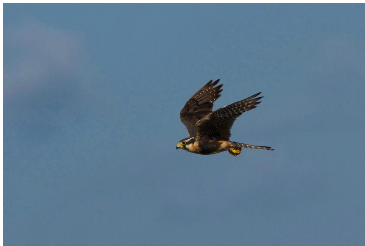
Aplomado Falcon

NIGHT: Lighthouse Boutique Hotel, Port Isabel