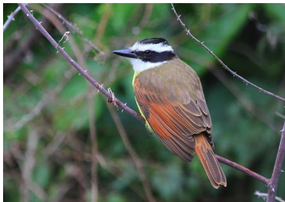
Great Kiskadee

After birding at the refuge, we will return to McAllen for lunch. After a short break at the hotel, we will spend part of the afternoon birding at Edinburg Scenic Wetlands. Located a few minutes north of McAllen, Edinburg Scenic Wetlands is a 40-acre site featuring wetlands, butterfly gardens, and a first-rate visitor center. Another of the World Birding Center satellites, the wetlands offer close encounters with nature in an otherwise urban setting, a delightful place that caters to local residents and visiting nature enthusiasts alike. A large tree-fringed lake is the park's centerpiece, and a great place to see various waterbirds at close range. While at Edinburg Scenic Wetlands, birders may be able to spot Least and Pied-billed grebes, Neotropic and Double-crested cormorants, Anhinga, Ringed and Green kingfishers, Great Kiskadee, and Couch's Kingbird. It is also a good spot for Buff-bellied Hummingbird in winter.