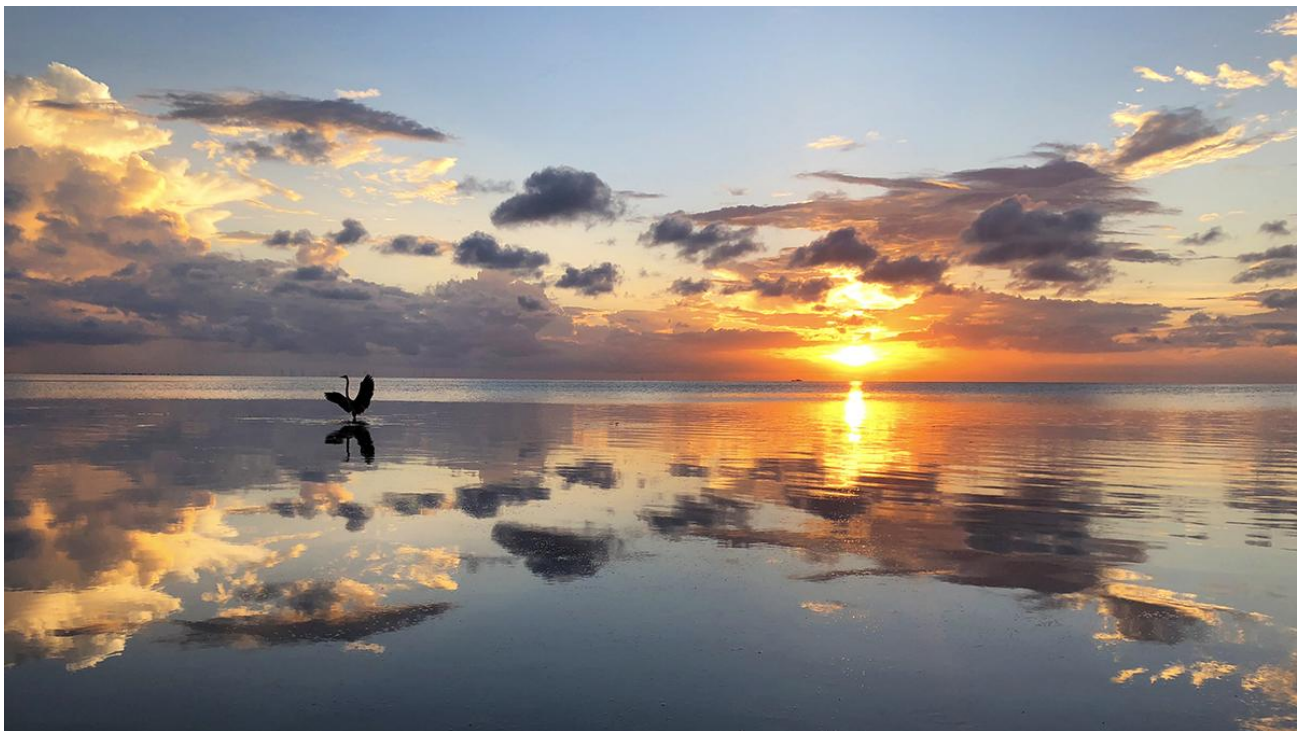
Lower Laguna Madre near Port Isabel

The Lower Rio Grande Valley of South Texas has long been known as one of America's greatest birding and wildlife areas. Few other regions in the country offer such unequaled birding opportunities combined with easy accessibility to diverse locations. Our new South Texas in Style tour will be based in two luxury hotels located near many of these prime