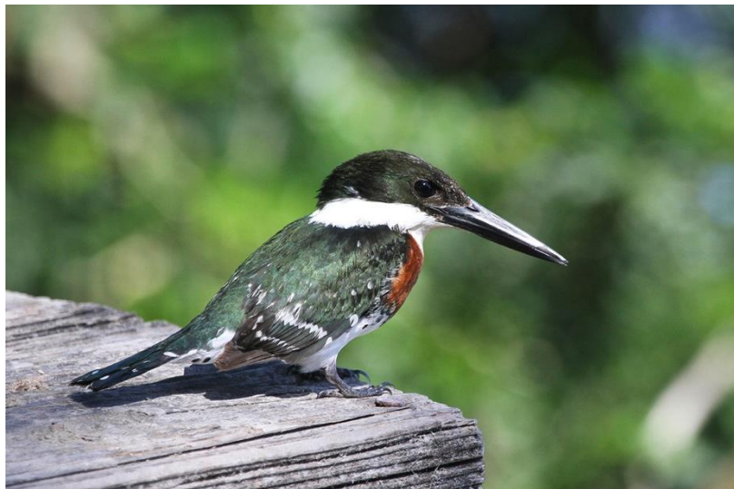
Green Kingfisher © Brad McKinney

January 23, Day 1: Morning Birding at Salineño and Post-Lunch Birding at Falcon State Park. After breakfast at Casa de Palmas, we will head northwest toward Zapata, stopping for a full morning of birding at the small riverside community of Salineño. For many years, Salineño has been the birding hotspot of the Falcon Dam area. There is a good view of the river here, and bird feeders nearby are maintained during the winter months by caretakers of the Valley Land Fund property. We will visit several other habitats in the area, including riparian woodland; arid, thorn-scrub forest; a water treatment pond; and the dump road. The bird feeders may attract Inca and White-tipped doves, Golden-fronted and Ladder-backed woodpeckers, Great Kiskadee, Green Jay, Bewick's Wren, Black-crested Titmouse, Clay-colored Thrush,