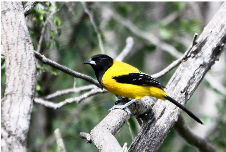
Audubon's Oriole

The feeders at Salineño are THE place to see both Audubon's and Altamira Orioles, as well as an assortment of South Texas specialties like White-tipped Dove, Golden-fronted Woodpecker, Green Jay, Long-billed Thrasher, and Olive Sparrow. During winter, there should also be several wintering species in the mix, including Eastern Phoebe, Blue-headed Vireo, Lincoln's and White-crowned sparrows, and Orange-crowned Warbler. Another target at Salineño is Morelet's Seedeater, a bird whose very limited U.S. range