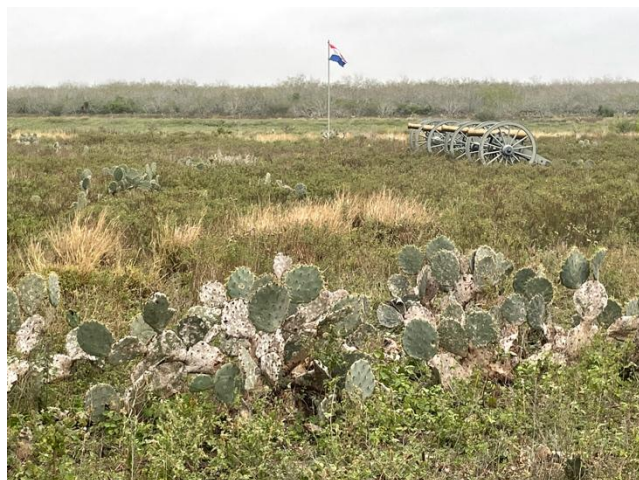
Palo Alto Battlefield

NIGHT: Lighthouse Boutique Hotel, Port Isabel