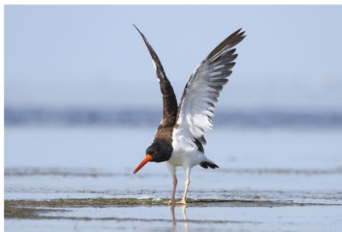
American Oystercatcher

Like the SPI Birding and Nature Center, the Convention Center has a boardwalk along the mangrove-lined wetlands that allow good viewing of Gulf Coast herons and egrets, and Clapper Rails. We will enjoy lunch at Blackbeard’s Restaurant, a local restaurant featuring delicious seafood, steak, and sandwiches since 1978. After lunch, we will visit the Isla Blanca Park and the Port Isabel Historical Museum. After some down time at the hotel, we will head out to dinner.